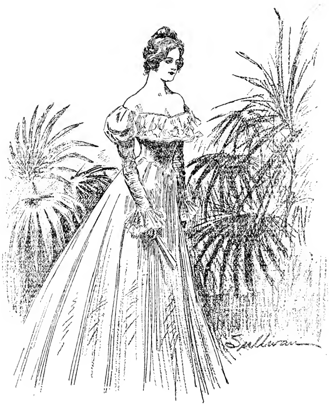
"The Washington Girl"